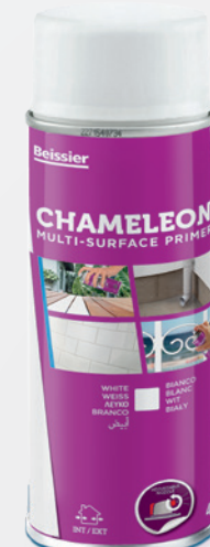
CHAMELEON SPRAY 400ML