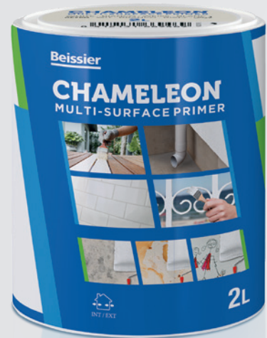
CHAMELEON PAIL 2L