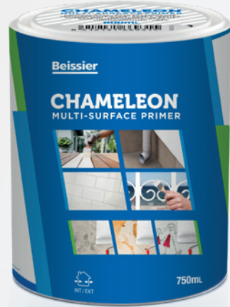
CHAMELEON PAIL 600ML