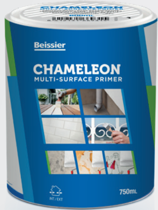
CHAMELEON PAIL 750ML